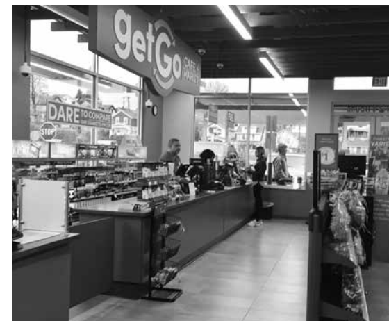
Edgewood's new GetGo

Edgewood residents have been looking forward to the opening of our own GetGo restaurant and gas station since building began many weeks ago. This GetGo store is, for now, the largest in Pennsylvania—at over 1000 feet larger than the next biggest store. It features a walk-in beer cave, outdoor seating and indoor dining area, fresh baked bread and bakery items and fresh hot foods. GetGo representatives love to think of their stores as restaurants that offer convenience items like gas and coffee—the emphasis is really on the quickness and quality of the food.