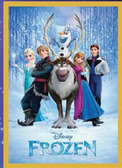
Frozen • June 25