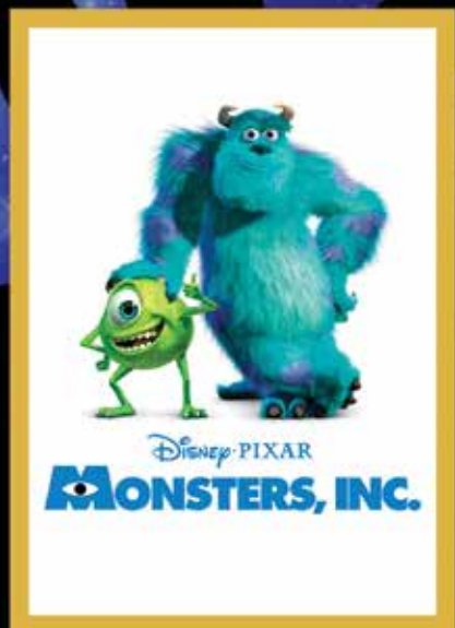
Monsters, Inc. • July 23