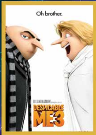
Despicable Me 3 • June 11